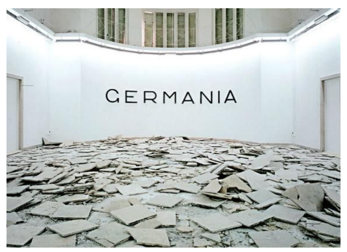
Hans Haacke, "GERMANIA" (installation shot), German pavilion, Venice Biennale, 1993