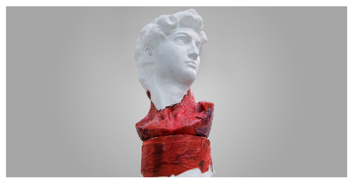
Yonatan Ullman, "Legacy" (detail), ArtSpaceTLV, 2015.

The statue was the symbol for ideals of freedom in the Republic of Florence; Ullman painted the back of the head in a similar blood-red to that of his (and Gershuni's) text. The combination between the wounded symbol of David on a crumbling floor, a text boding ill, and the covert memory of a dystopia of power generates anxiety.