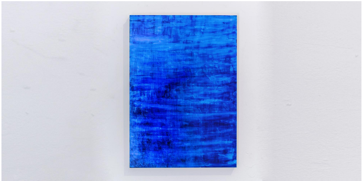
Yonatan Ullman, : 'The Earth As It Is Seen From The Moon', varnish and silver leaf of formica, 40x50 cm

A small, shiny, semi-reflective blue work could be seen in the far corner of the gallery - This work is titled: 'The Earth As It Is Seen From The Moon'.