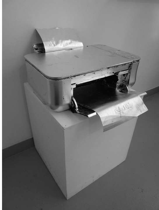
Yonatan Ullman, Bureaucracy, 2015, silver leaf on printer and paper, 50 x 40 x35 cm

Beneath his gentle profile, every detail of a ready-made working printer was painstakingly gilded in silver.