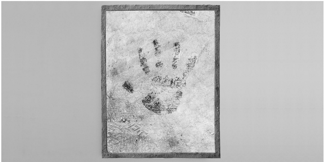
Yonatan Ullman, The Moon’s Surface, cement on cardboard, 40x50cm (each)

Upon entering the gallery, viewers stepped on to “The Moon’s Surface - cement powder that - wall to wall - covered the entire floor of the gallery.