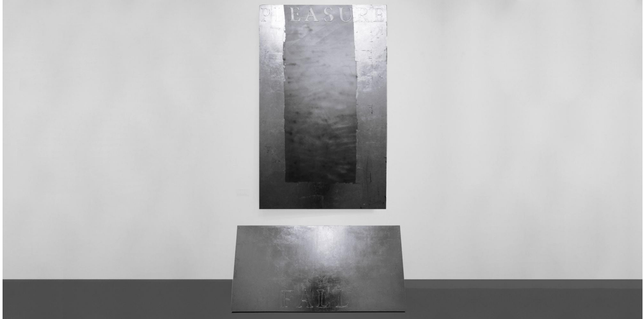
Yonatan Ullman, Pleasure - FALL, 2015, gesso, spray paint and silver leaf on plywood, pleasure: 200x100 cm, FALL 70x120 cm

A large gray surface is partly gilded in silver.