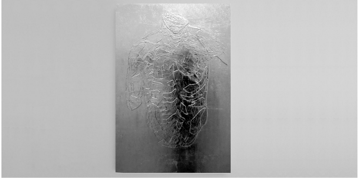
Yonatan Ullman, Torso, 2015, gesso and silver leaf on panel, 70x100cm

This is a group of works which gild surfaces, low reliefs and objects in silver, thus, giving them a timeless aura.